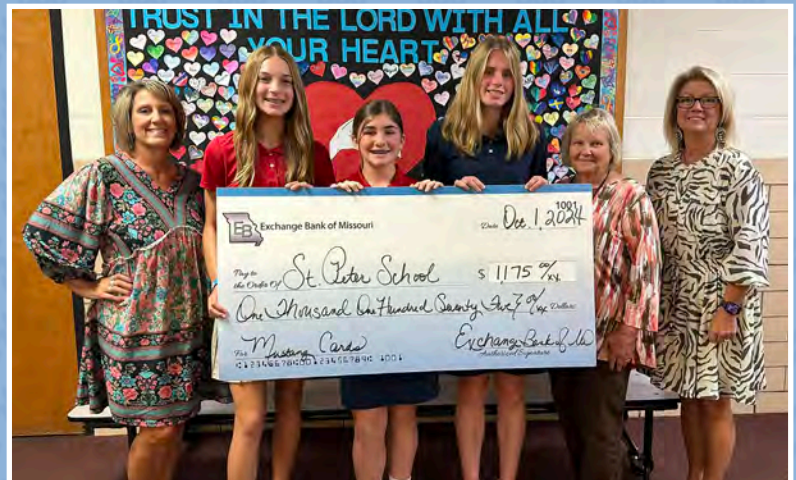
Pictured Above: St Peter School in Marshall MO, receives a donation of $1,175 from our Marshall Branch.