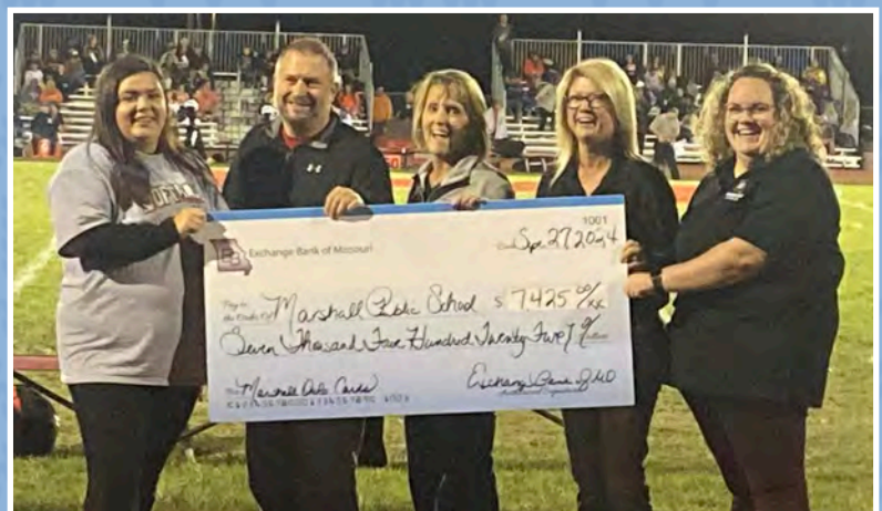
Pictured Below: Our Marshall Branch presents a check to Marshall Public School for $7,425.