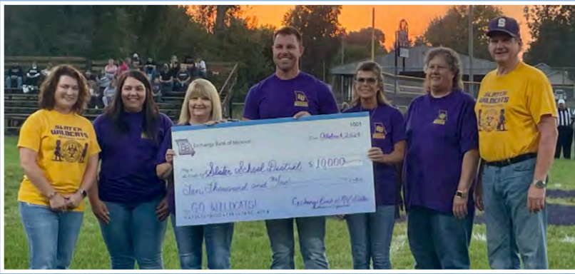
Pictured Above: Slater School District is presented with a check for $10,000 from our Slater Branch.