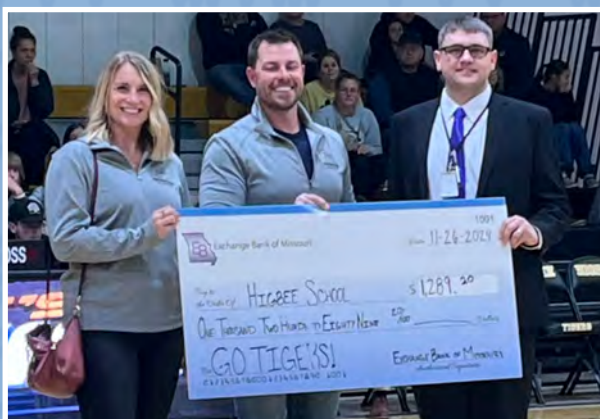
Pictured Above: EBMO had the pleasure of presenting a check for $1,289.20 to the Higbee School District.