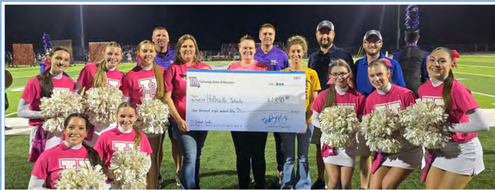
Pictured Left: Hallsville Schools is given a check from our Hallsville Branch in the amount of $1,850. EBMO also provided a Tailgate for the community in honor of Senior Night.