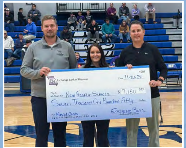
Pictured Above: New Franklin Schools receives a check for $7,150 from the New Franklin Branch.