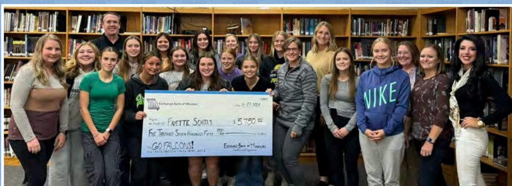
Picture Left: The Fayette Branch presents a check for $5,570 to Fayette Schools.