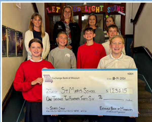
Pictured Above: St. Mary's School was given a check for the amount of $1,236.15, from the Fayette Branch.